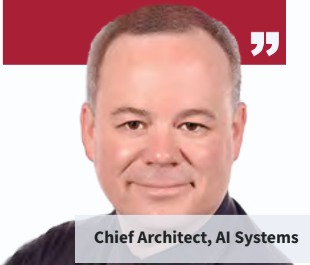
Chief Architect, AI Systems